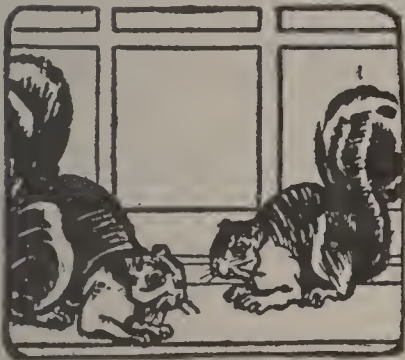
They Found Plenty of Nuts.

“A LITTLE girl named Gwen had fixed a squirrel house on a pear tree near an old apple tree. From the little house the squirrels could jump about the branches, and that is what squirrels enjoy doing. They certainly had the most beautiful time playing,” said daddy as he began Jack’s and Evelyn’s story.